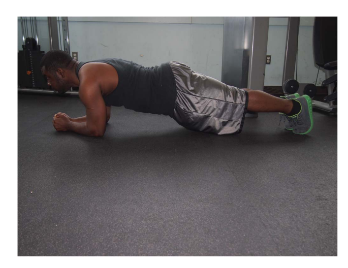
Figure 8. The prone bridge.

under the hips (Figure 10). An athlete maintains a neutral spine and pelvis. The athlete performs an ADIM and extends an arm and their contralateral leg simultaneously. The athlete returns to the starting position and repeats with the other arm and leg. Compensatory movements, including pelvic rotation or a lateral lean with the torso, should be avoided. One repetition performed on each side equals one repetition total. An athlete performs 3 sets of 10 repetitions. This exercise has been shown to elicit 46% MVIC for the LM, 56% MVIC for