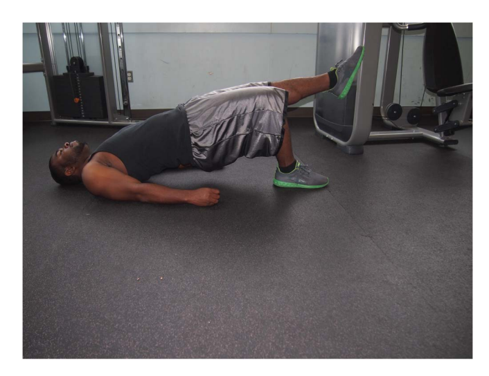
Figure 7. The unilateral back bridge. The gluteus maximus and the lumbar multifidus are activated to a greater extent when this exercise is performed using only 1 leg as a base of support.

program of side bridges performed 3 times weekly for 5 weeks produced significant thickening of the EO and was the most effective of the 4 different stabilization exercises at increasing the thickness of the transverse abdominis (88). In their EMG study, Ekstrom et al. (20) reported a mean activation of 69% of MVIC of EO in the side bridge and 74% MVIC for the gluteus medius (Figure 9).