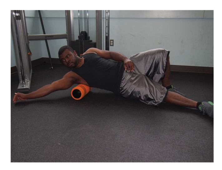
Figure 5. Foam rolling for the latissimus dorsi. The upper arm can also be medially and laterally rotated to shorten or lengthen the muscle while rolling.

strength gains can be expected if a muscle contracts at 40% of maximum voluntary isometric contraction (MVIC) or higher.