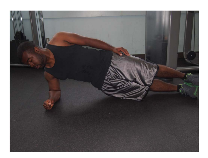
Figure 9. The side bridge exercise.

are warmed up. An athlete performs each stretch for 3 sets of 30 seconds on each side.