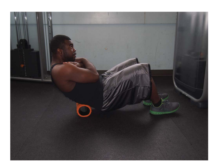
Figure 4. Foam rolling for the erector spinae group. Should be performed with the spine both flexed and extended, and the roller should pass from the base of the neck down to the pelvis.

Based on the previously cited research on the efficacy of isometric strengthening to increase endurance of the trunk musculature, and a desire to minimize lumbar flexion-extension cycles during training, the authors recommend a program consisting of largely isometric exercises. As noted by Ayotte et al. (2),