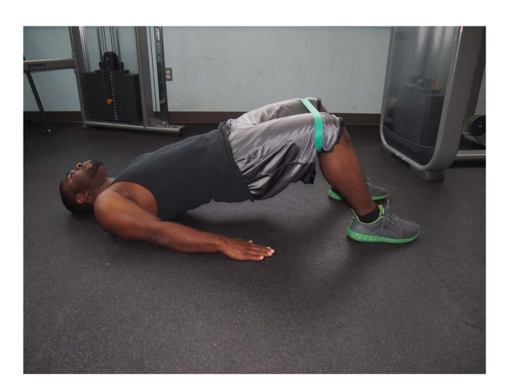
Figure 6. The back bridge performed with a band around the knees. The addition of an adducting force seems to increase recruitment of the gluteus maximus and decreases anterior tilt during the performance of this exercise.

Side bridge. Athlete lies on their side, performs an ADIM, and lifts their body off the ground, using their elbow and ipsilateral foot as points of support. Athletes maintain an erect posture with their ankles, knees, and shoulders in a straight line. The athlete performs 3 sets of 30 seconds initially, and works up to 3 sets of 45–60 seconds. A