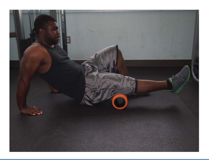
Figure 3. Foam rolling for the hamstring group. Perform passes with the hip medially and laterally rotated, and with the hip in a neutral position.

Erector spinae. Remaining in a supine position, athletes should lie with arms across their chest, hips, and knees flexed, and the foam roller in contact with the middle of their back. The athlete should then perform passes of the