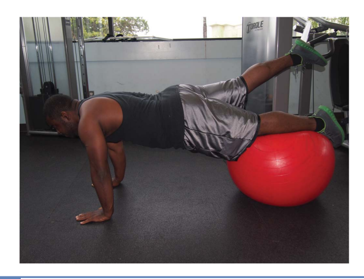
Figure 12. Prone hip extension on a physioball. Another exercise building on the prone bridge. Successful performance requires minimizing lumbar rotation and isolated hip extension.